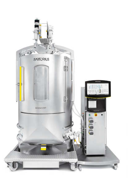
Biostat STR® 1000