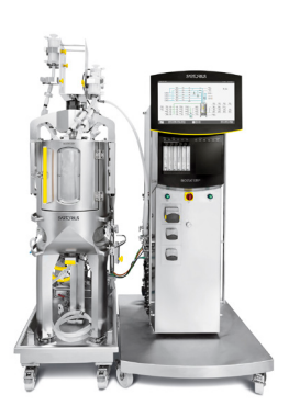
Biostat STR® 50