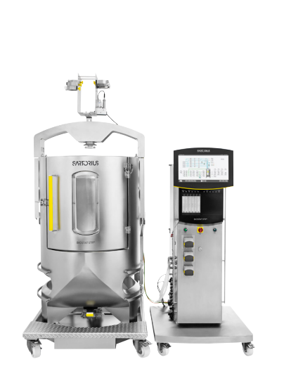
Biostat STR® 500