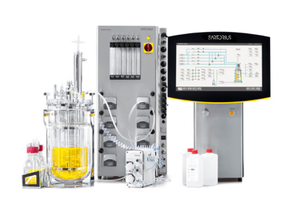
Biostat® B-DCU with Univessel® Glass 1-10 L