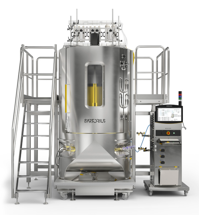
Biostat STR® 2000