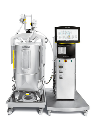
Biostat STR® 200