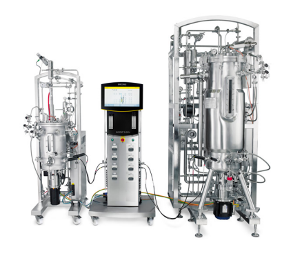
Biostat® D-DCU 10 - 200 L