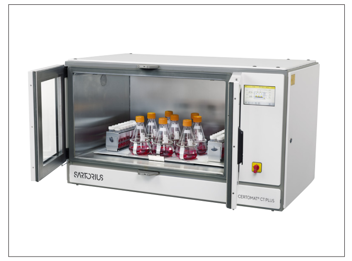
Real-time PCR kit for the specific and sensitive detection of Mycoplasma DNA \,

A standard DNA extraction followed by a TaqMan® probe real-time qPCR is used for the detection of Mycoplasma DNA. 200 \mu l to 18 ml sample volume can be used as starting material for the DNA preparation. The isolated DNA is amplified in a qPCR cycler and the evaluation can be performed with the standard cycler software.